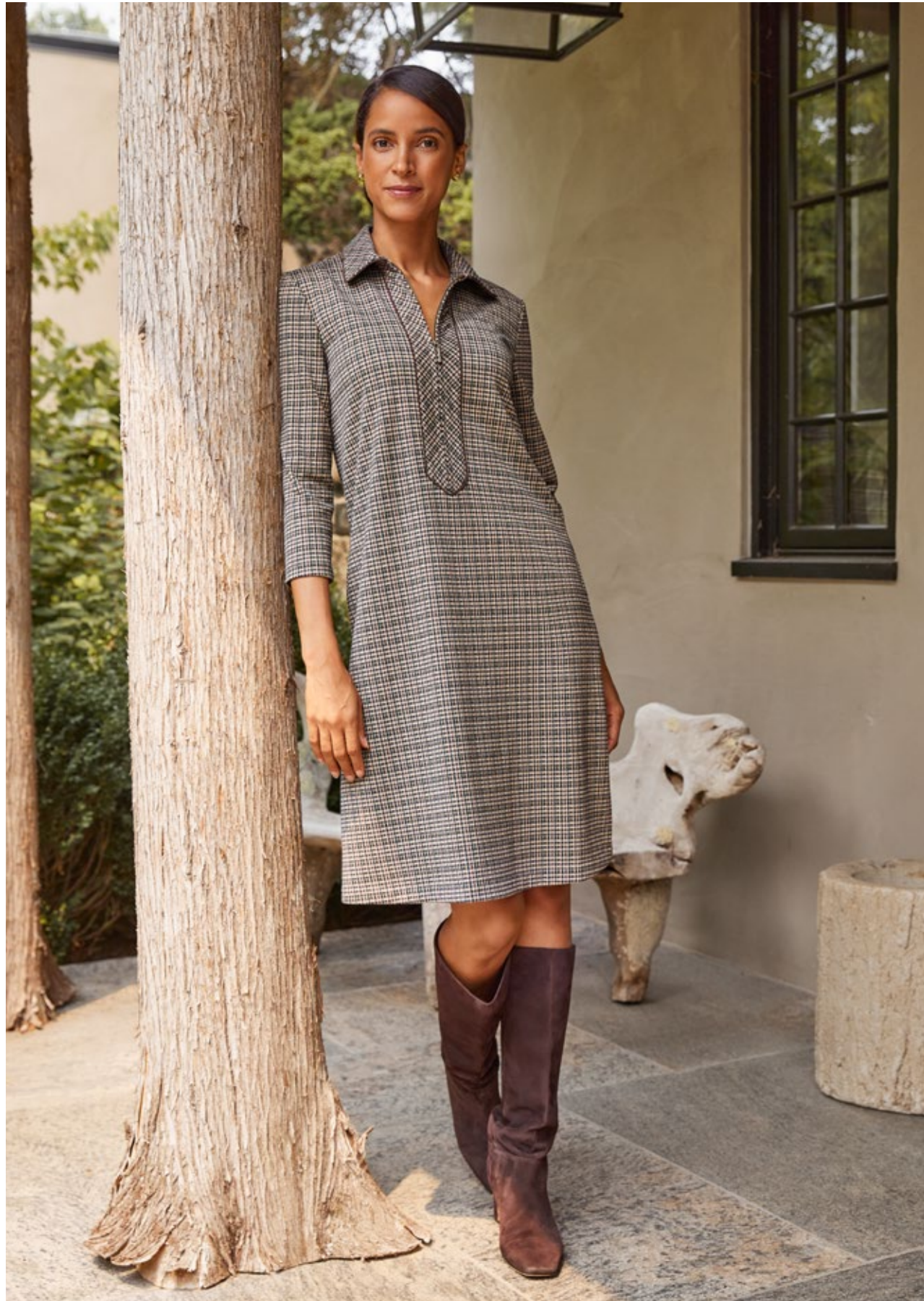
left page MAKAYLA DRESS $228, 0184113104, BRIANA BOOTS $368, 0182391022. this page CLARA SWEATER $378, 0182901022, 0182901022.