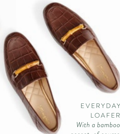
EVERYDAY LOAFER With a bamboo accent, of course.

left page, clockwise ANGELIQUE SNEAKERS $168, O185851022. ALEXIS HAT $88, O168285284. FRANNIE CARDIGAN $198, O181211022. ARIANNA HANDBAG $268, O181531022. DILLON LOAFERS $268, O184494050. HENDLEY SWEATER $258, Gray and Off white, O174371022. LAYLA SCARF $168, O175925284. WATSON PANT $178, O185061022. SELENA SUNGLASSES $138, O17681022. this page JILLIE SCARF $198, O184942038. EARLE SWEATER $268, O182951022.