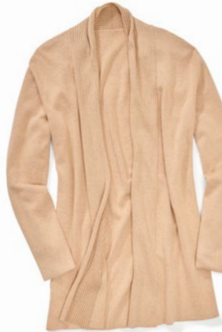
COZY CARDIGAN The perfect top layer.