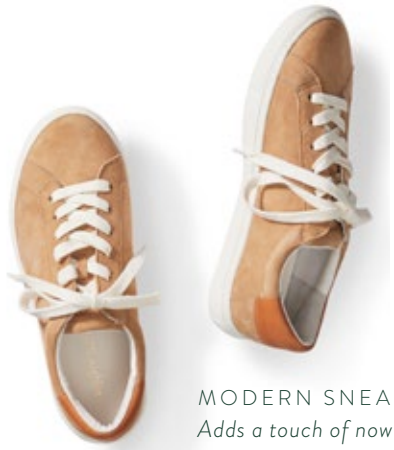
MODERN SNEAKER Adds a touch of now to every look.