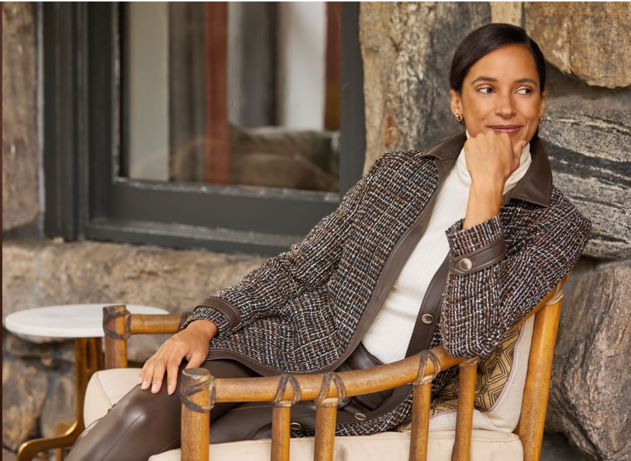
left page NATALIE WRAP $248. 0185011022. JANA TOP $138. 0184461022. MINI JAIPUR SCARF $178. 0098165255. right page MALIN COAT $298. 0184241167. ARLETTE TURTLENECK $158. 0011451022. HASTINGS PANT $278. 0186991022.