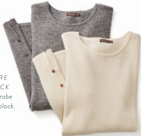
CASHMERE CREWNECK A luxe wardrobe building block.