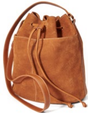
RICH CARAMEL SUEDE The bucket bag = the carryall of the season.