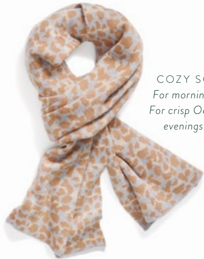
COZY SCARF For morning walks. For crisp October evenings.