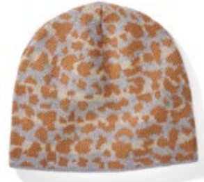
LEOPARD POP Because it's a neutral in our style book.