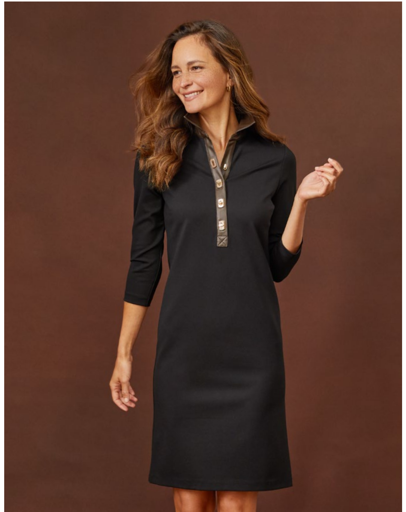
left page DELMAR DRESS $298. 0186491022. JAIPUR SCARF $268. 0139841022. this page FALCON DRESS $228. 0184131022.

OUR EXCLUSIVE FAUX LEATHER SHIFT FEELS AS FABULOUS AS IT LOOKS