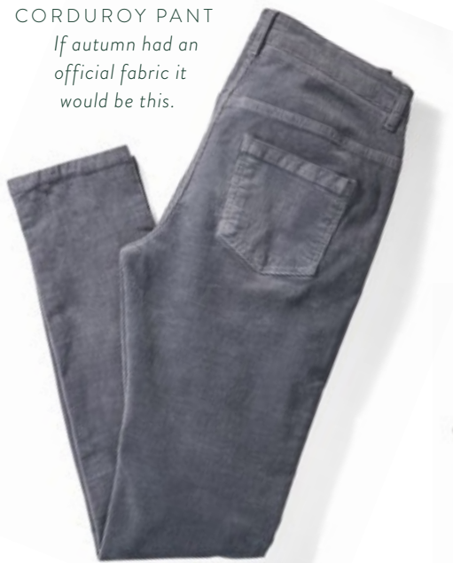
CORDUROY PANT If autumn had an official fabric it would be this.