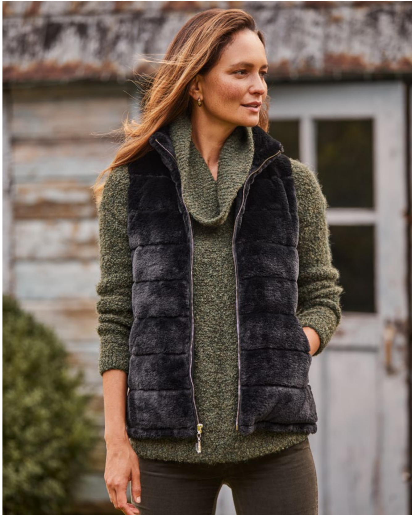
this page GRACIE VEST $278. 0185751022. LULU SWEATER $298. 0181331022. WATSON PANT $178. 0185181022. right page SARABETH JACKET $248. 0185801022. CLARA SWEATER $378. 0182901022. CARTER PANT $198. 0155911022. ANGELIQUE SNEAKERS $168. 0185851022.